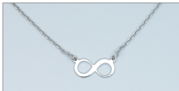
NK INF MINI wit - rod - verm