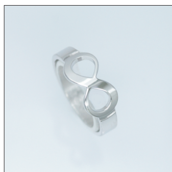
R INF wit - rod - verm